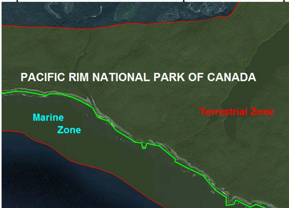
Figure A1: An illustration of a sample protected area with two zones. The image shows a portion of the Pacific Rim National Park of Canada boundary in Google Earth with a sample marine-terrestrial delineation of the ocean portion from the terrestrial portion.

The use of zones within a protected area, as described in detail in the previous section, allows different portions of protected areas to hold different values for various attributes. Examples of these attributes include marine vs. terrestrial, IUCN class, the provinces or territories that the protected area is found in, date of establishment, or others.