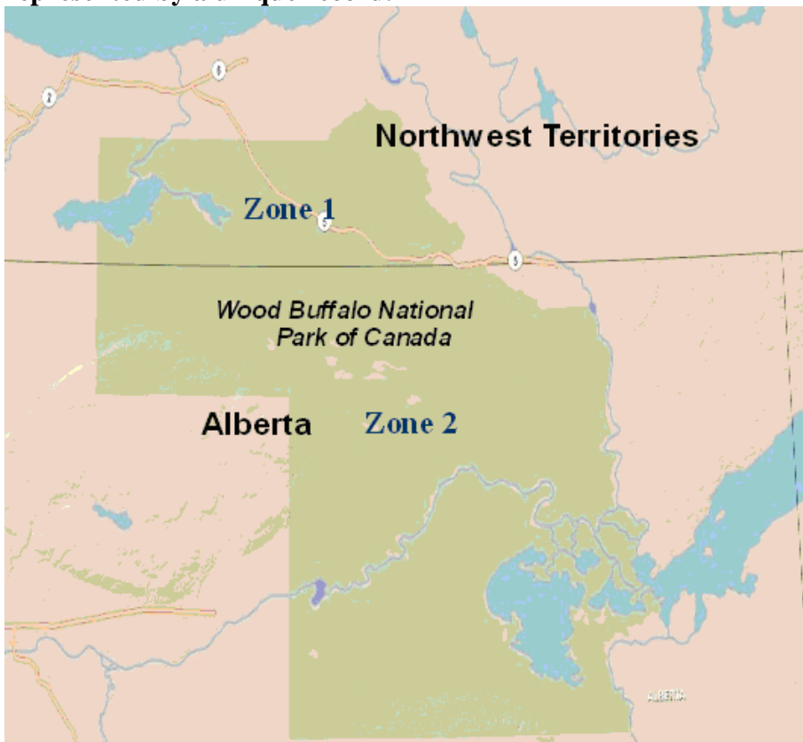
Figure 1: A single park divided into two physical zones based, in this case, on the province or territorial jurisdiction that the portions lie within. In CARTS, each zone is represented by a unique record.

It is desirable to have one IUCN category for each protected area for national and international reporting purposes. According to the IUCN Guidelines (2008), the category that applies to at least 75 percent of the area should be used. However, there are some instances in Canada where management plans for protected areas identify zones that take into consideration local conditions [such as marine areas (DFO), land use categories (MB), and nature reserve zones (ON)]... (p.29)